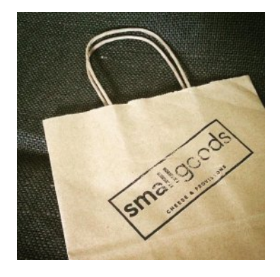
Get 10% off your purchase with your Queso Diego membership

The Cheese Store 1980 Kettner Blvd. #30 San Diego, CA 92101