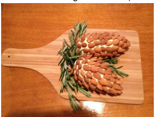
Bacon and Spring Onion Cheese Christmas Tree Well, bacon

Shape cheese into pinecones, then decorate with almonds and rosemary sprigs (can easily be done with homemade goat cheese!)