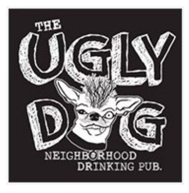
Get 10% off your purchase with your Queso Diego membership

The Ugly Dog 6344 El Cajon Blvd. San Diego, CA 92115