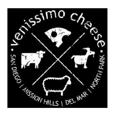
Get 10% off your purchase with your Queso Diego membership

Curds and Wine 7194 Clairemont Mesa Blvd. San Diego, CA 92111